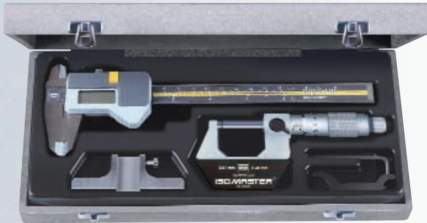
TESA® Duo-Set 8