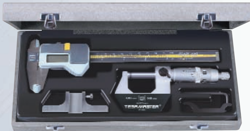
TESA® Duo-Set 9

Inspection report with a declaration of conformity